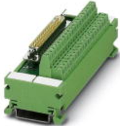
VARIOFACE module, with screw connection and D-subminiature socket strip, for assembly on NS 35/7.5, 9 positions

Please be informed that the data shown in this PDF Document is generated from our Online Catalog. Please find the complete data in the user's documentation. Our General Terms of Use for Downloads are valid ( http://download.phoenixcontact.com )