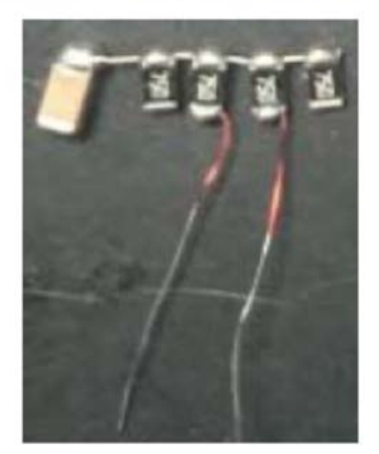
Wire connection and dressing:

Manual solder the capacitor & resistor .