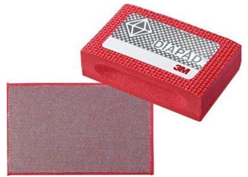
Portable abrasive makes finishing hard-to-reach areas achievable

3M<sup>TM</sup> Flexible Diamond Hand Lap 6200J is a versatile hand-held abrasive that optimizes the sharp cutting action of diamond mineral to grind and finish many materials, including chilled iron, granite, carbide, composites, non-ferrous metals, thermal spray coatings and exotic alloys.