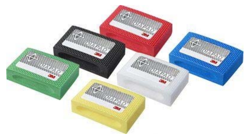
Available in a range of grades tailored to meet different project needs

3M™ Flexible Diamond Hand Lap 6200J was ergonomically designed to enhance operator comfort. The contoured foam backing assists with grip, so an even level of pressure may be applied over the surface area. Additionally, because Diamond Hand Lap 6200J is hand-held it can easily get into those stubborn, hard-to-reach areas.