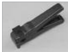
2-Step Cable Stripper with adjustable replacement blades for RG-6, 58, 59 & 62. Poly bagged.