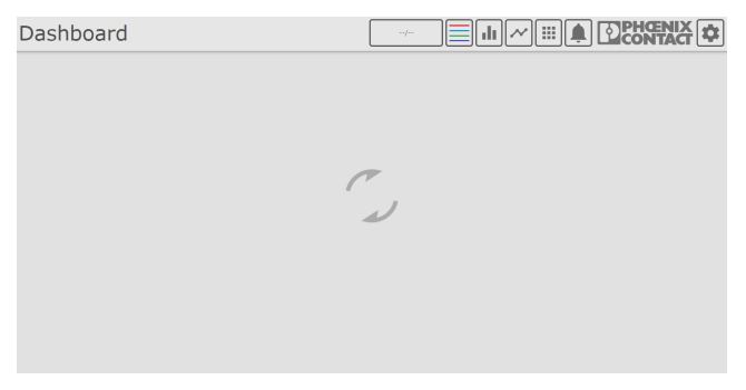
Figure 3 Initial connection loading screen

Open a browser (Google Chrome<sup>™</sup> or Mozilla<sup>®</sup> Firefox<sup>®</sup> are recommended) and enter http://192.168.0.5 in the "Address" field to load the user interface.