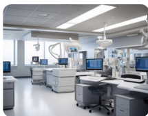
Intelligent Medical Care