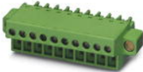
The figure shows a 10-position version of the product

Plug component, Nominal current: 8 A, Rated voltage (III/2): 160 V, Number of positions: 14, Pitch: 3.81 mm, Connection method: Screw connection, Color: green, Contact surface: Tin