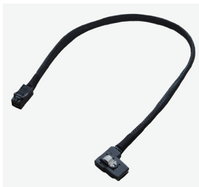
Internal Mini-SAS HD to mini-SAS Right Angle end Cables