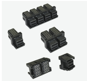
Internal Mini-SAS HD Connectors