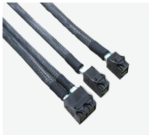
Internal Mini-SAS HD Cables