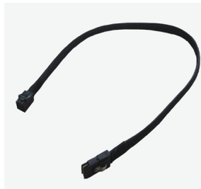
Internal Mini-SAS HD to mini-SAS Straight End Cables