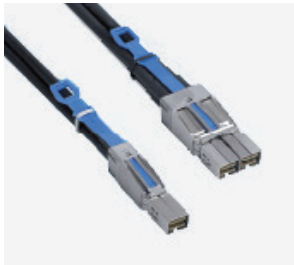
External Mini-SAS HD Cables