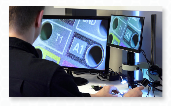
HDMI Mode (View on an HD monitor)

Gooseneck LEDs Position LEDs for optimal illumination