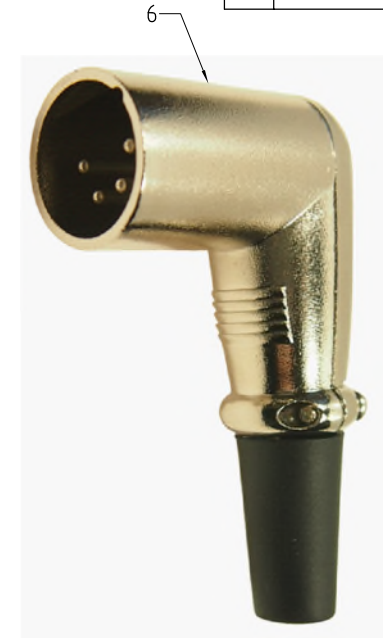
4 POLE MALE