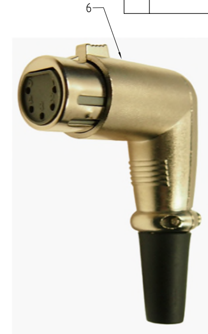
5 POLE FEMALE