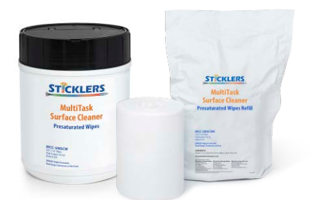
Refills reduce costs & waste!