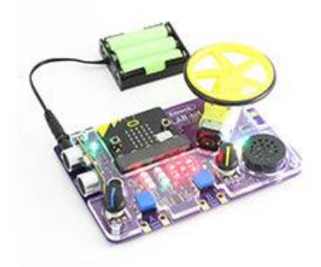
Highly Interactive With 4 onboard inputs and 5 onboard outputs, plus those added by the micro:bit itself.