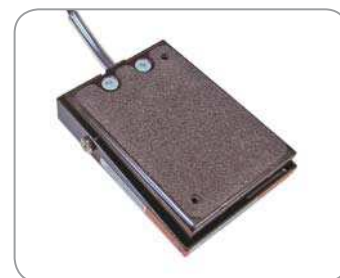
Optional hands free foot pedal.

Distributed by: Ph: 800-537-0351 Fx: 800-379-9903