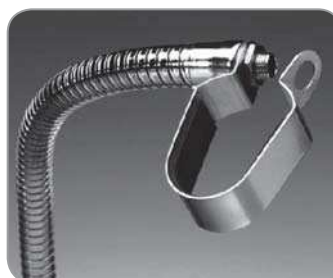
Optional hands free Gooseneck mounting stand.

The AirForce is lightweight, flexible and easy-to-use. With strong blow-off power the AirForce is effective in removing particle contamination.