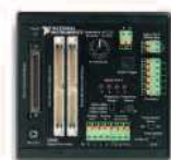
DAQ Signal Accessory