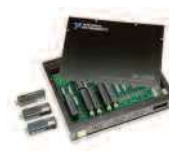
SCC Portable, Modular Signal Conditioning