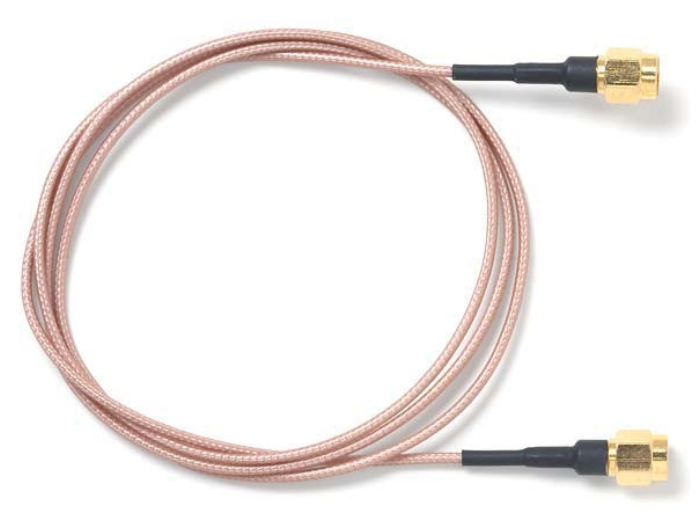
Model 4846-UU SMA Plug to SMA Plug, RG178B/U