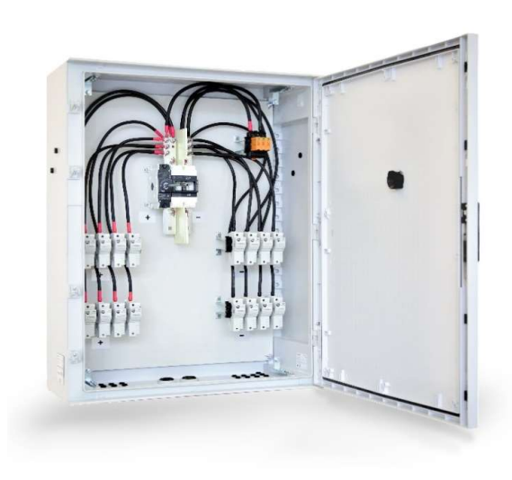
Example of PV DC Combiner Box. Picture may differ from product.