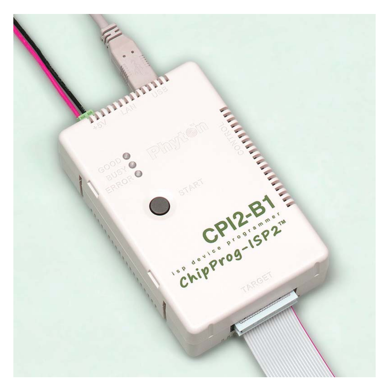
CPI2-B1-TIC2K – universal programmer