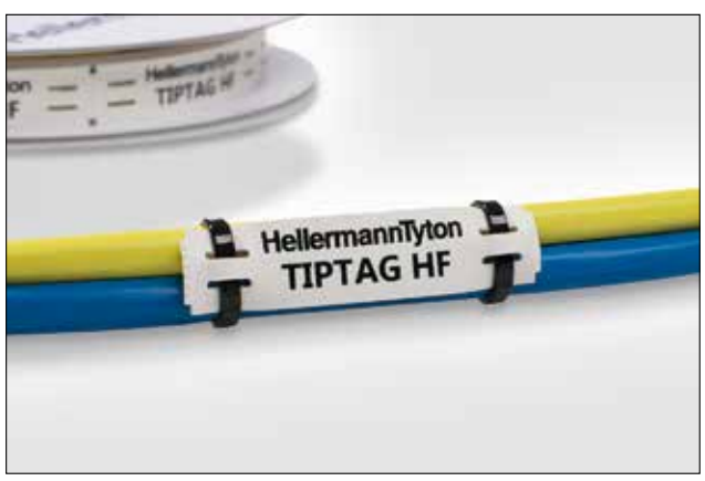
TIPTAG - High performance cable bundle marking.