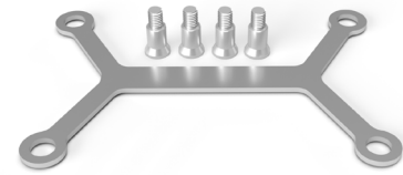
Fig. 1 - Leaf spring with screws for mounting heat sink