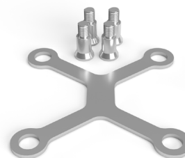
Fig. 1 - Leaf spring with screws for mounting heat sink