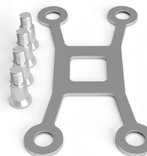
Fig. 1 - Leaf spring with screws for mounting heat sink