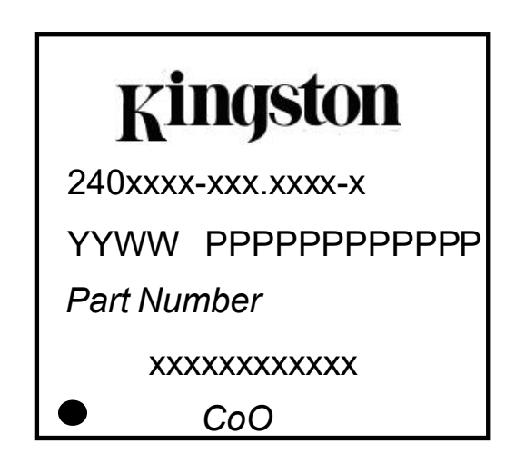
Figure 4 - EMMC Package Marking