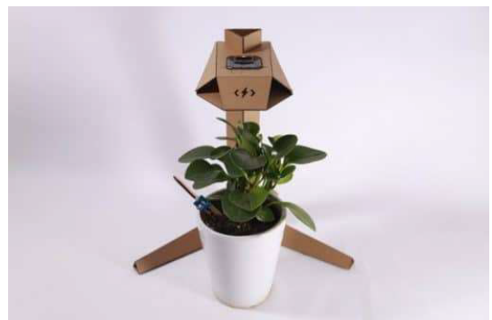
Smart Farm Kit | TokyLabs _2-10-22