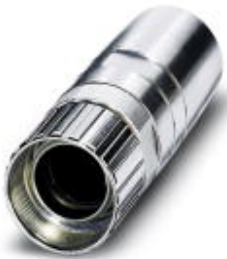
Sleeve housing for cable connector, straight, Screw locking, M23, Shielded: Yes, Cable cross section: 6.5 mm...14.5 mm

Please be informed that the data shown in this PDF Document is generated from our Online Catalog. Please find the complete data in the user's documentation. Our General Terms of Use for Downloads are valid ( http://download.phoenixcontact.com )