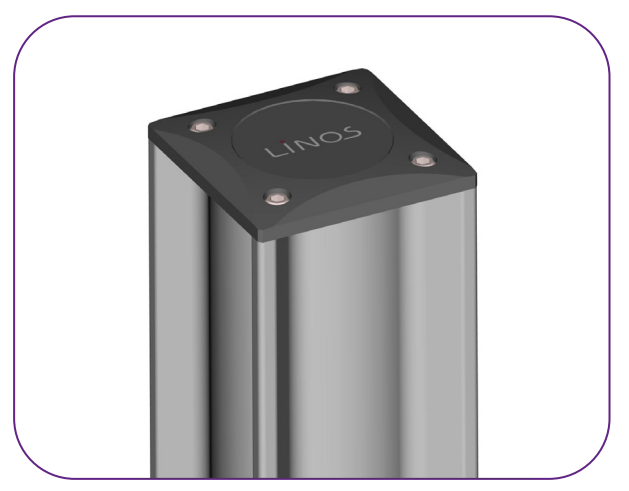
Application Example: The Cover Plate X 95 closes one end of a Profile X 95.