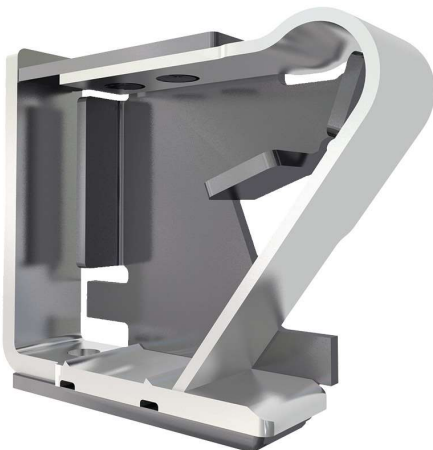
Solid PUSH IN contact Safe and durable