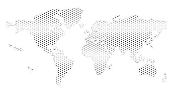
*Currently 3 carriers available, 4th coming by Q4 2022