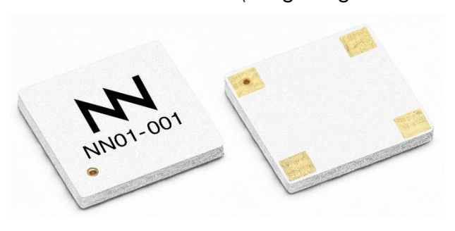
PAT US 7,148,850, US 7,202,822