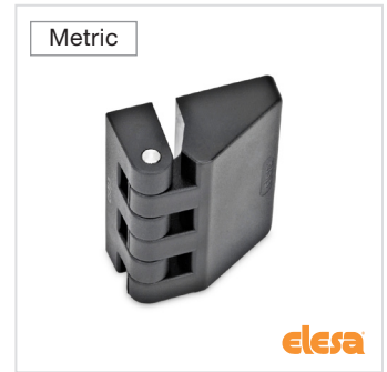
ELESA original design CFD.

Bores for socket cap screws #5 / #8 / #10 / 1/4" or DIN 912-M3 / M4 / M5 / M6