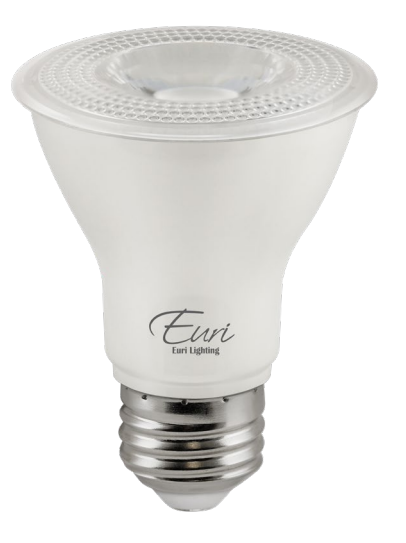
Available only as a twin-pack. (EP20-7W6000e-2 twin-pack contains 2 LED Bulbs.)