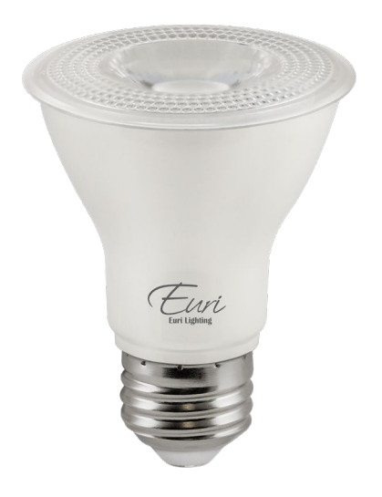
Available only as a twin-pack. (EP20-7W6040e-2 twin-pack contains 2 LED Bulbs.)