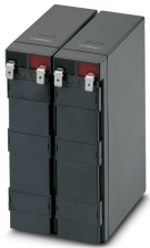
Replacement battery for UPS-BAT/VRLA... energy storage

Please be informed that the data shown in this PDF Document is generated from our Online Catalog. Please find the complete data in the user's documentation. Our General Terms of Use for Downloads are valid ( http://phoenixcontact.com/download )