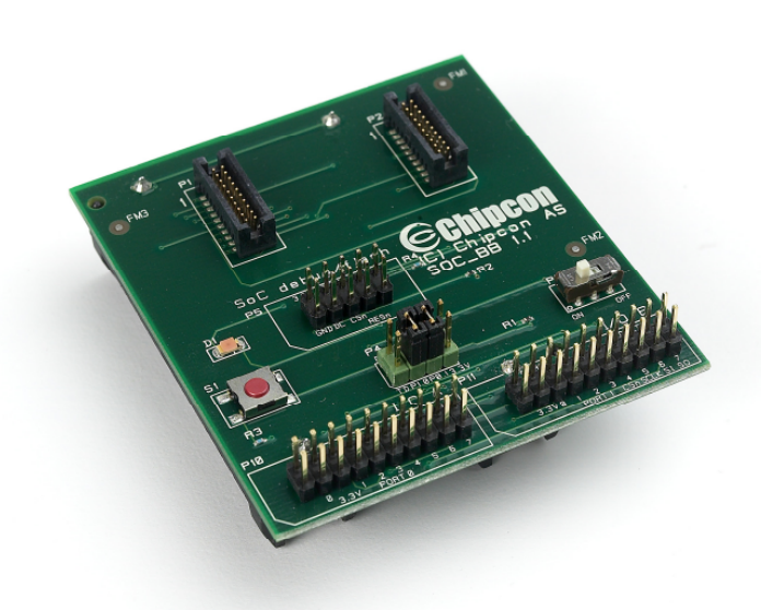
Figure 1 - SoC Battery Board