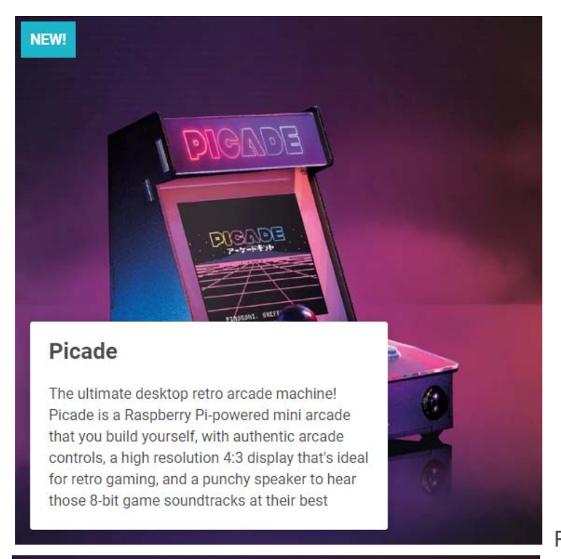
PIM468 Picade – 8-inch display