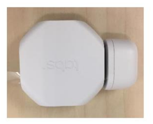
Figure 8: Sensor / Magnet Alignment