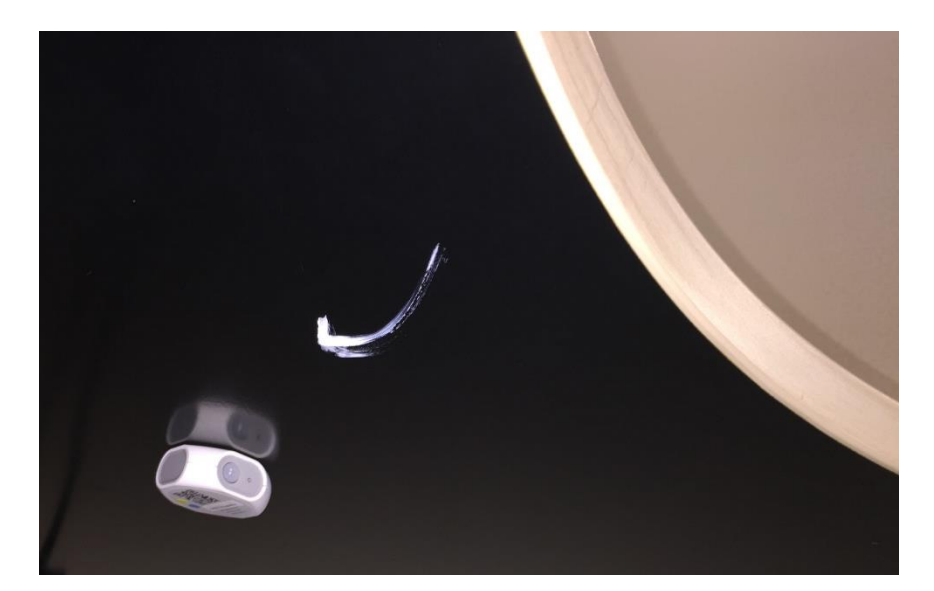
Figure 9: Desk Occupancy Sensor

3. The Desk Occupancy sensor may be mounted on the underside of a desk using the double-sided tape provided. For best results, mount the sensor horizontally approximately 25 cm from the front edge of the desk, as shown in Figure 9.