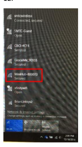
Figure 12: Mini-hub network