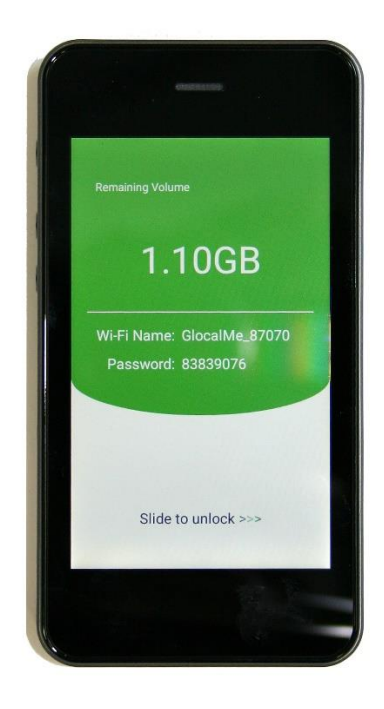
Figure 4: GLocal Logon Complete

4. Once the hotspot displays the Wi-Fi name and Password, as illustrated in you can start setting-up the mini-hubs.