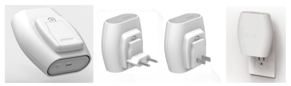
Figure 5: Plug-in the mini-hub

5. Remove the cover plate on the first mini-hub. If necessary, attach the power adapter before plugging-in the mini-hub to a wall socket as shown in Figure 5.