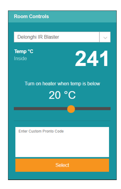
Figure 11: Entering Pronto codes for the IR Blaster

Next, navigate on your browser to your kit's dashboard. Click on the Environment tab on the left hand side. You will be presented with a screen which includes a place where the Pronto code can be entered as shown in Figure 11.