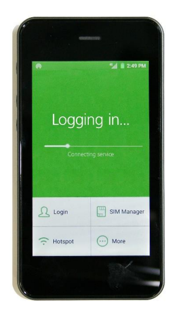
Figure 3: Automatic Logon

3. The hotspot will automatically log-in and connect to the GlocalMe service.