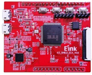
Figure 1 ICE Shield top view