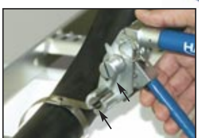
Position the CT-7 in loading position (ratchet handle forward) then place the band through Tool Nose and Winding Mandrel. Make sure there is plenty of band through the Mandrel.