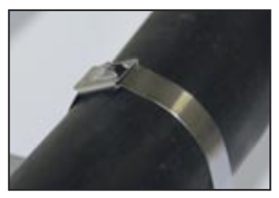
This band is installed. Discard leftover band material and move on to the next install!