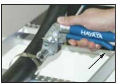
Grip Ratchet Handle and pull back toward Handle to tighten band.