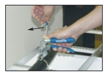
With a firm grip on the CT-7, grasp Cutter Handle with other hand.