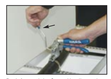
Push forward the Cutter Handle to trim the band.