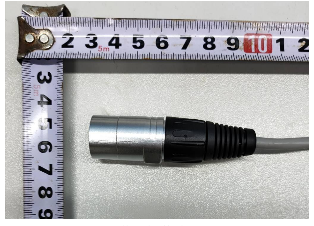
Network cable plug