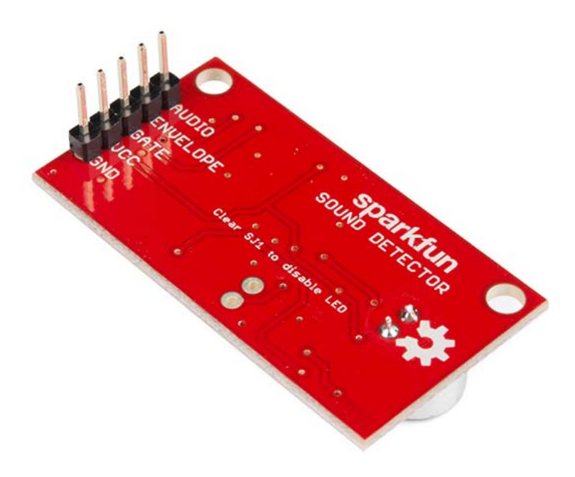
https://www.sparkfun.com/products/14262 https://www.sparkfun.com/products/14262 \ 11-21-18