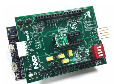
A1006 Demo-Dev Kit Orderable Part Number: Kit-A1006-SHIFLD