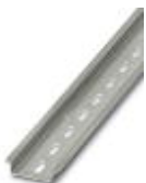
DIN rail, material: steel galvanized and passivated with a thick layer, perforated, height 7.5 mm, width 35 mm, length: 2000 mm

DIN rail perforated - NS 35/ 7,5 PERF 2000MM - 0801733