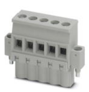
The figure shows a 5-pos. version of the product in gray

Plug component, Nominal current: 12 A, Rated voltage (III/2): 320 V, Number of positions: 5, Pitch: 5.08 mm, Connection method: Screw connection, Color: pastel green, Contact surface: Tin