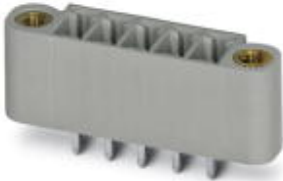
The figure shows the 5-pos. version of the product in gray

Header, Nominal current: 8 A, Rated voltage (III/2): 160 V, Number of positions: 11, Pitch: 3.5 mm, Color: pastel green, Contact surface: Tin, Mounting: Soldering