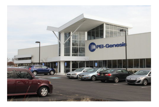
Corporate Headquarters, Philadelphia, PA