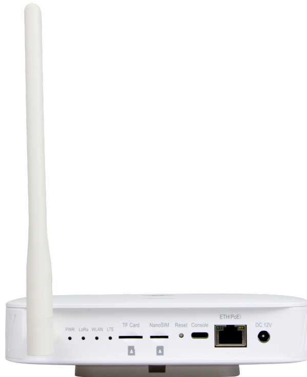
Figure 2: WisGate Edge Lite 2 Interfaces

The hardware interfaces of RAK7268 gateway include DC 12 V, ETH interface, Console interface, Reset key, TF Card slot, Status indicator LEDs, LoRa Antenna connector, etc.